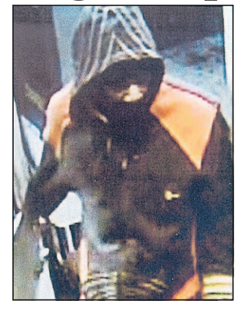
Suspect in a robbery at a Franklin Square gas station

The man is described as in his thirties, between 5-foot-10