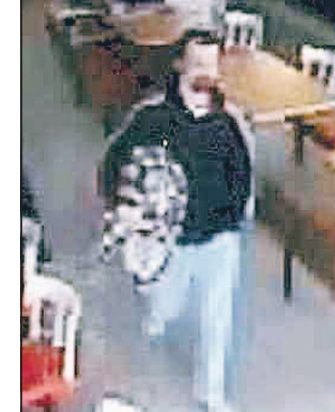
Man suspected of stealing donation jar in Patchogue

On the surveillance video, he is seen wearing blue jeans